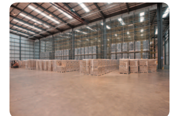
14.1m high bay