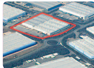
25 major occupiers on site